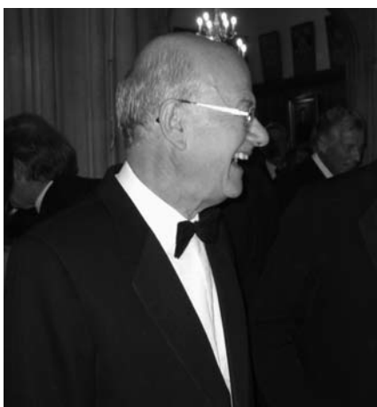
The Lord Chief Justice