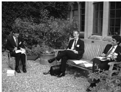
Preparing for the next round

room doing one-to-one video reviews. This division of labour meant that there was an opportunity for detailed discussion and two sets of feedback in respect of each exercise.