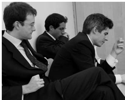
Pondering the feedback

The standard of teaching was exceptional and we were privileged to receive advice, guidance and demonstrations from many eminent members of the profession both in this country and from abroad. It was particularly helpful to get an inside view as to what judges find useful and persuasive. Conversely it was eye-opening to hear what they found unhelpful and irritating.