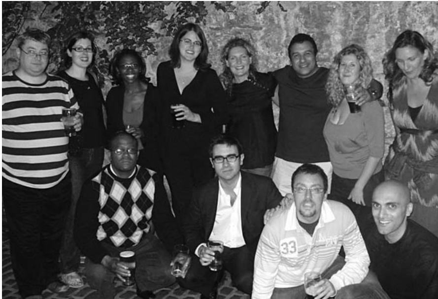
After a long day's advocacy