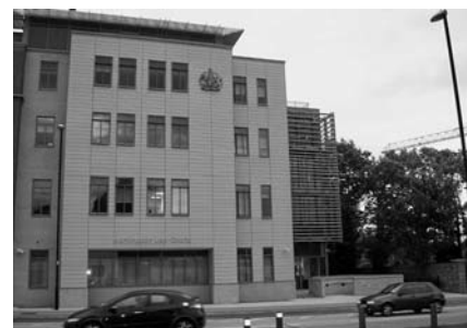
Huntingdon Crown Court