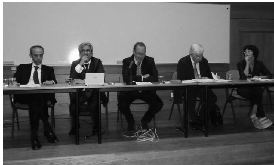
The Bars meet