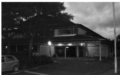
Peterborough Crown Court

There is a surprising dearth of restaurants in the city centre, unless you want Chinese, Italian or Indian food, but East Oriental restaurant situated above Charters serves good quality Thai, Chinese and oriental food. The better restaurants tend to be located in the villages and suburbs. The city has