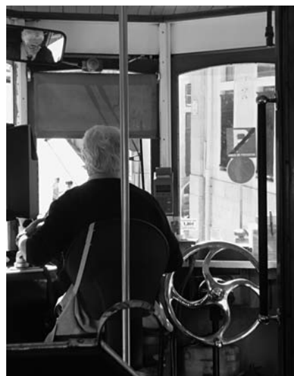
The right kind of tram

Saturday evening saw several dinner groups set forth to sample Portuguese cuisine. One cohort dined at the somewhat dubiously named 'Bloody Nose', hoping that its name did not reflect on the establishment itself but that it merely lost something in the translation. Despite sounding like an old fashioned east end pub where patrons are grateful to finish an evening with both knee-caps intact, this was a delightful restaurant, serving excellent food and wine, and with friendly staff. Another group, led by Judge Geoffrey Breen, went to a busy restaurant specialising in live fado, Portugal's famous urban (melancholic) folk music.