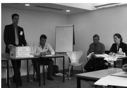
The delegates at work